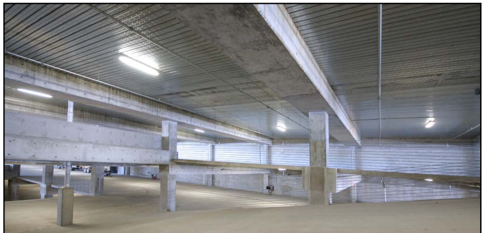
Versa-Dek® Composite (shown) and Deep-Dek® Composite fit into any support structure: column-supported steel, concrete, or composite beam framework.

Composite decking's strength and rigidity provide design flexibility: Thin-slab floors optimize floor-to-floor and building height; clear spans can reach up to 36'; electrical and plumbing services are integrated efficiently; and weight-bearing walls or structures can be placed at optimized spans that can facilitate up to 4-stall widths. The result is budget-friendly and visually appealing, with clean sightlines, a more open atmosphere, and reflective coating options that brighten the structure.