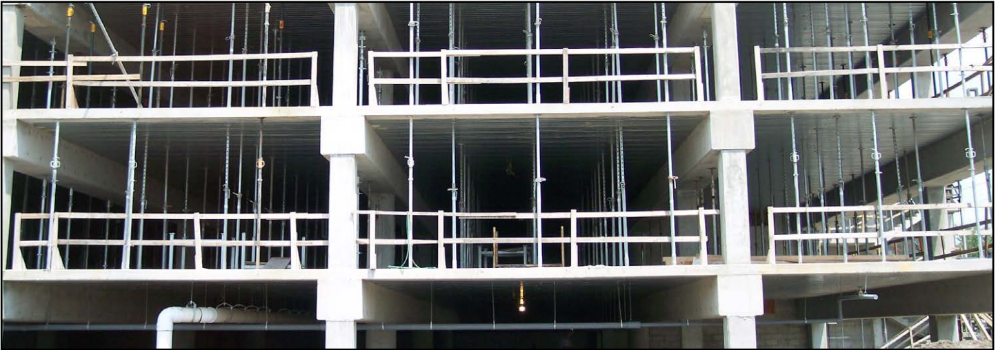
Composite deck results in reduced overall story and facility height thanks to a thin-slab floor design that uses up to 40% less concrete than traditionally poured-in-place concrete floors.