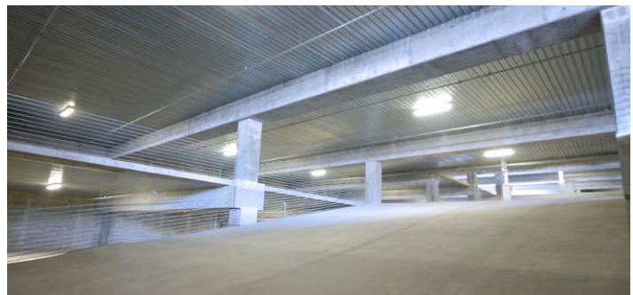
Composite deck can lead to parking garages that are open, bright, and have clean sightlines.